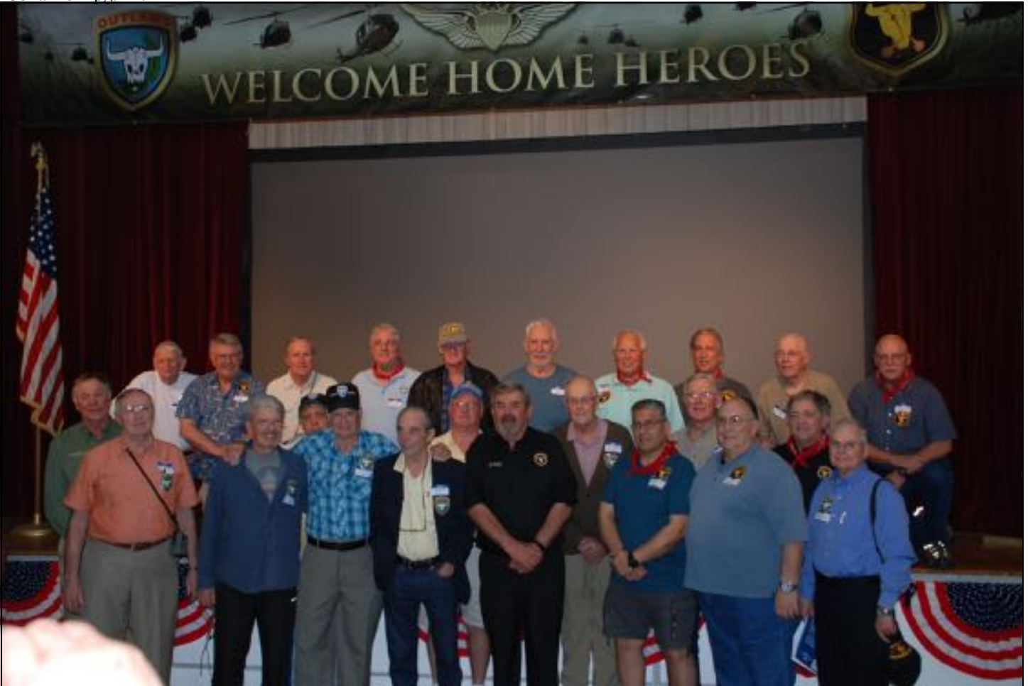
The Reunion members of the Battle of Easter Sunday. 50th. Anniversary held March 23rd. thru Sunday, the 26th. 50 years to the day. What an awesome group of Veterans.